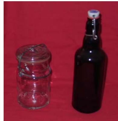
Lightning seal jar and bottle

Instructions for using the newer jars did not start appearing in cookbooks until the 1870s, even though wax sealers and other fruit jars were being marketed. Some manufacturers included instructions with their jars but not all provided this service to their customers. The hot water bath process has changed very little from the time it was introduced in 1806.