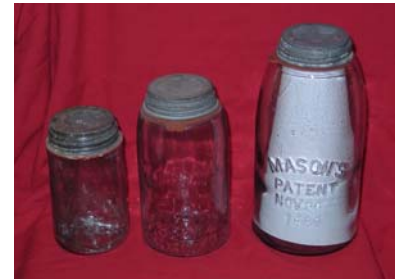
Pint, quart and half-gallon jars in correct shapes for an impression. All three have the Mason legend and patent date (not manufacture date). Paper has been inserted into the half-gallon to better illustrate the legend.

The illustrated examples are the correct shapes of period jars, even if they may not be jars actually manufactured in the 1860s. One may expect to pay between $10 and $15 dollars for a pint jar with a zinc lid; $8 to $15 for a quart jar with a lid; and $15 to $20 for a half-gallon jar with the zinc lid. Ball jars tend to be the most common seen in antique shops some having the Mason’s legend or date and some are the correct shape for period jars, but the Ball name is a dead giveaway for a late nineteenth century date; the price range for Ball jars is usually between $2 and $5.