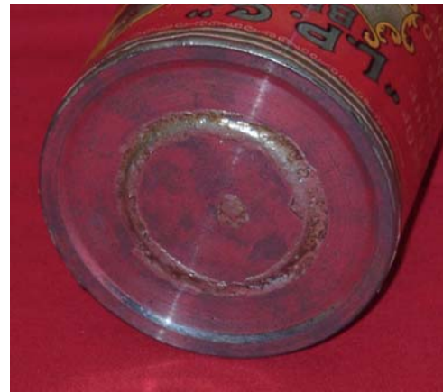
Notice the round top with the “doughnut hole” in the center and the tipped pinhole in the center of the “doughnut hole”

The cans of the nineteenth and early twentieth centuries were different to the cans we use today. They were “hole in the top” cans; the bottom and curved sides were attached and then a top, that resembled a flattened doughnut was attached and the seams were sealed with a half lead/half tin solder. The cans were shipped to the consumer and canneries in several parts; the can with the top attached and the “hole” which had a small hole punched in the center. After sterilizing the cans, the cannery or consumer filled the can and “capped” it with the “doughnut hole.” Air was exhausted from the can through the pin hole by placing the cans in boiling water for a specified period of time which depended on the contents of the can. After the air was exhausted, the small hole was “tipped” or sealed with the solder and then the cans were covered with boiling water processed in the hot water bath, The cans were cooled as quickly as possible and labels were applied.