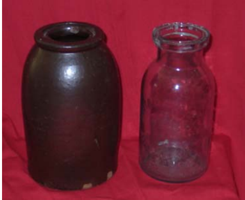
Stoneware wax sealer and glass wax sealer

On July 18, 1854 James Spratt was granted a patent for “Improvement in Hermetical Sealing.” Recognizing the problem of inexperienced people soldering the metal can tops and vent hole, he patented a that used a combination of a gum-elastic (rubber) gasket and cement in a trough. The lids were screwed down and tightened with a special wrench. His original patent was not well received but other inventors applied the same principle and produced a variety of containers with the trough around the top for a sealing agent.