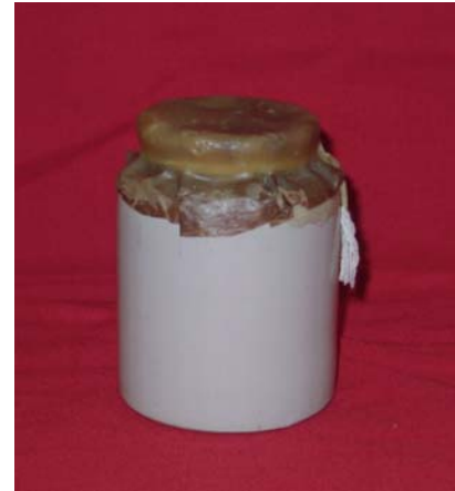
Stoneware crock covered with paper and dipped in wax

Excluding air from preserved food had been used in conjunction with other methods for preserving many vegetables, fruit, nuts and eggs but the air was not drawn out of the container; the contents of the container were only protected from dust, dirt, and vermin. The container was merely covered with a bladder, leather, paper or cloth covered with cement or wax. This method was not the same as canning where the interior air was exhausted during processing or the later vacuum packing.